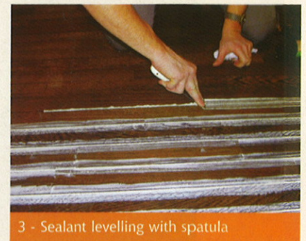
3 - Sealant levelling with spatula

GUARANTEE : NAVYLAM® flooring is guaranteed for 10 years on floor installations provided that :