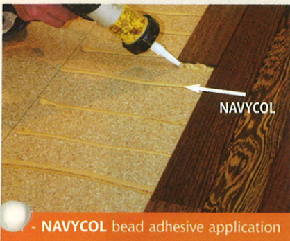
1 - NAVYCOL bead adhesive application

INSTALLATION : NAVYLAM® flooring is a tongue and groove fit. A 5mm expansion gap for a surface area of 10m 2 must be left around any protruding parts. To ensure the maximum water resistance, apply NAVYCOL adhesive to all the end joints. Allow the adhesive approximately 12 hours to dry before allowing light foot traffic and Navyjoint sealing.